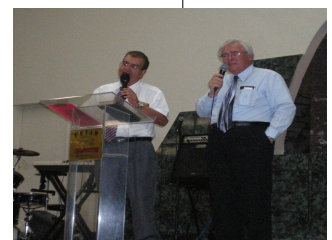
TEACHING IN EL SALVADOR