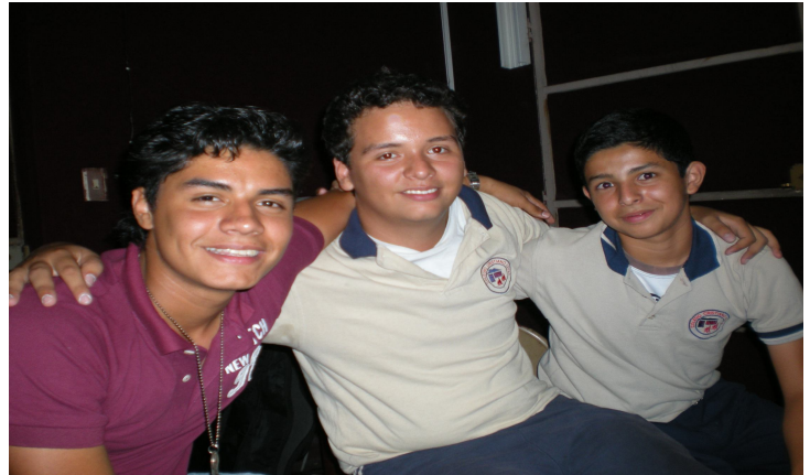
Our purpose— give young people like these an opportunity to realize the love of God and the power of His forgiveness.